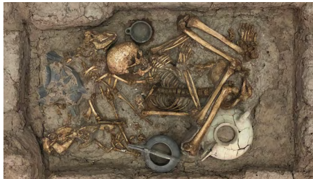
Qazvin Museum – The grave of a 3,000-year-old woman discovered in the historic site of Segzabad–BouinZahra