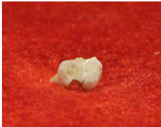
Qazvin Museum – Neanderthal human tooth discovered from Qala kurd cave, Avaj