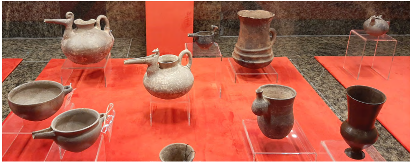
Qazvin Museum – Objects from Segzabad historical site – Bouin Zahra From the sixth millennium BC to the Achaemenid period